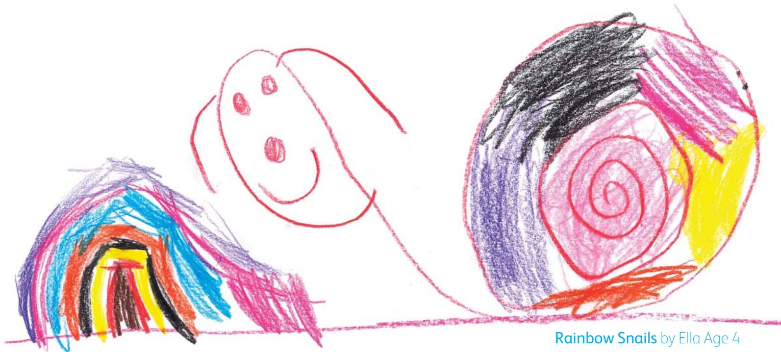
Rainbow Snails by Ella Age 4