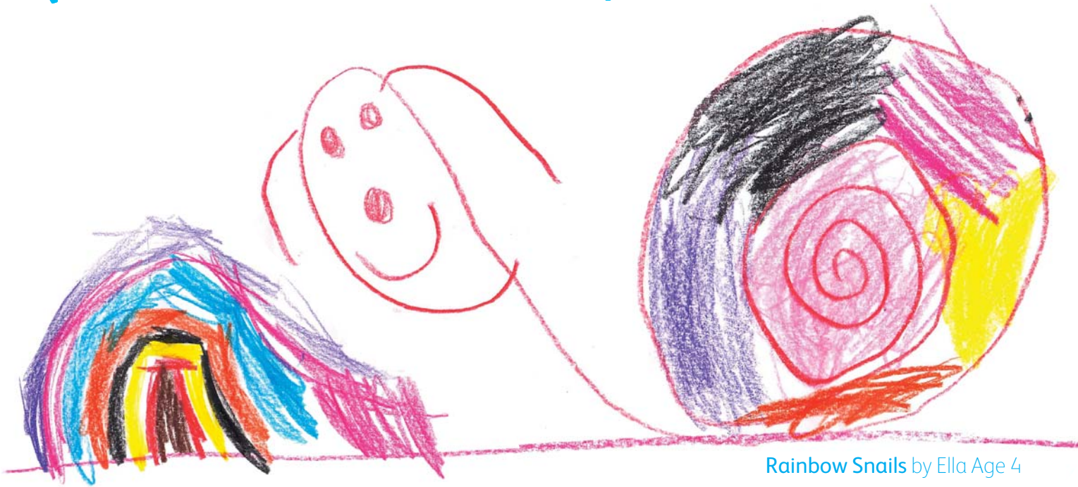
Rainbow Snails by Ella Age 4